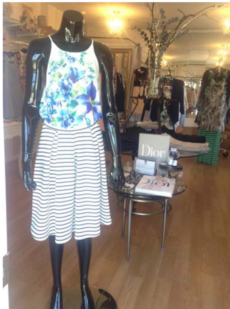
Stay cool in stripes and prints from Glamorous Boutique in Lafayette.